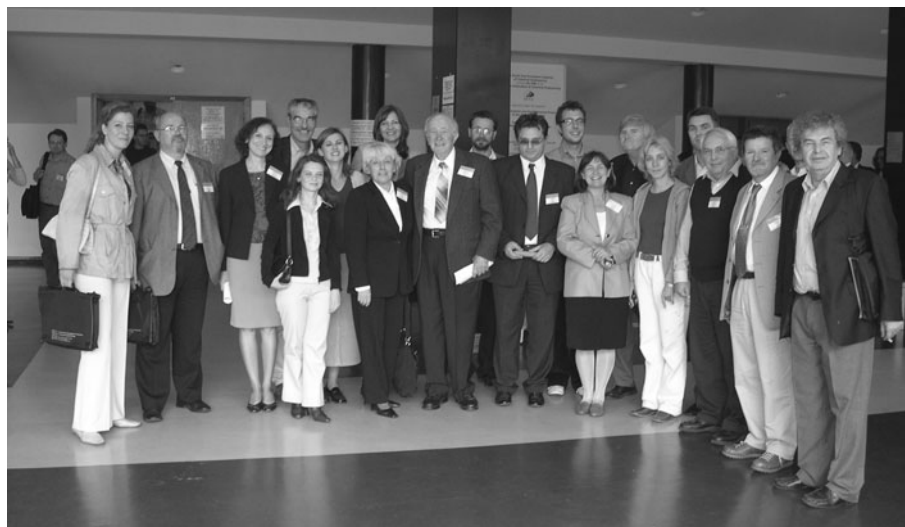
Delegates at the 1st South-East European Congress on Chemical Engineering.

One of the expected outcomes of the Congress was its promotion as a future traditional conference. The Hellenic Association of Chemical Engineers has been proposed for host organizer of the 2nd South-East European Congress of Chemical Engineering which was unanimously accepted.